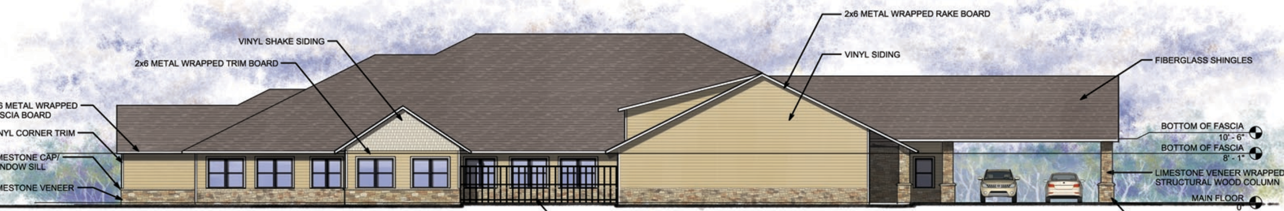
② EAST ELEVATION 1/8" = 1'-0"

EAST ELEVATION AREAS: TOTAL WALL AREA 224,807 SQ. IN. TOTAL WINDOW AND STONE AREA 90,990 SQ. IN. = 40.47%