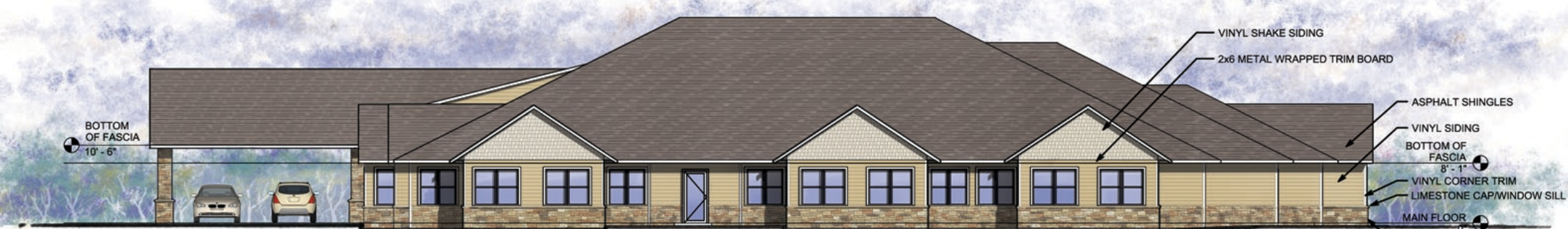
① SOUTH ELEVATION 1/8" = 1'-0"

WEST ELEVATION AREAS: TOTAL WALL AREA 193,821 SQ. IN. TOTAL WINDOW AND STONE AREA 91,421 SQ. IN. = 47.18%