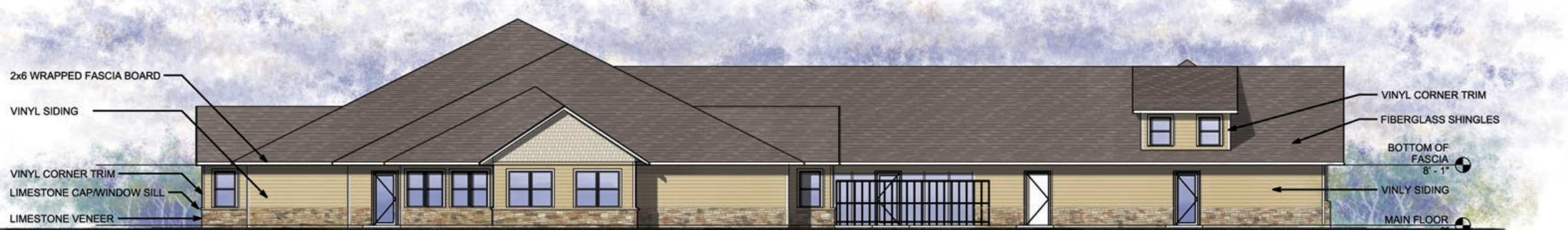
③ WEST ELEVATION 1/8" = 1'-0"

SOUTH ELEVATION AREAS: TOTAL WALL AREA 195,127 SQ. IN. TOTAL WINDOW AND STONE AREA 95,609 SQ. IN. = 48.99%